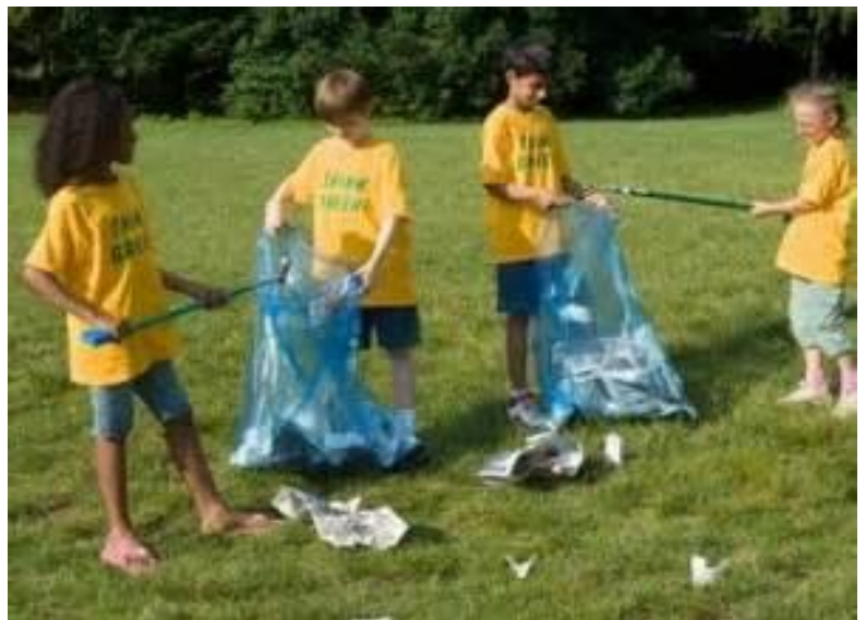
New volunteers in training

Parks need volunteers to help run the parks and manage their natural resources. Volunteers staff contact stations and visitor centers, conduct environmental education programs, beautify the parks, develop and maintain trails, help visitors find what they need and make nearby communities' more aware of park offerings and activities. These are serious duties and responsibilities, so committed volunteers must be willing and able to reliably carry them out.