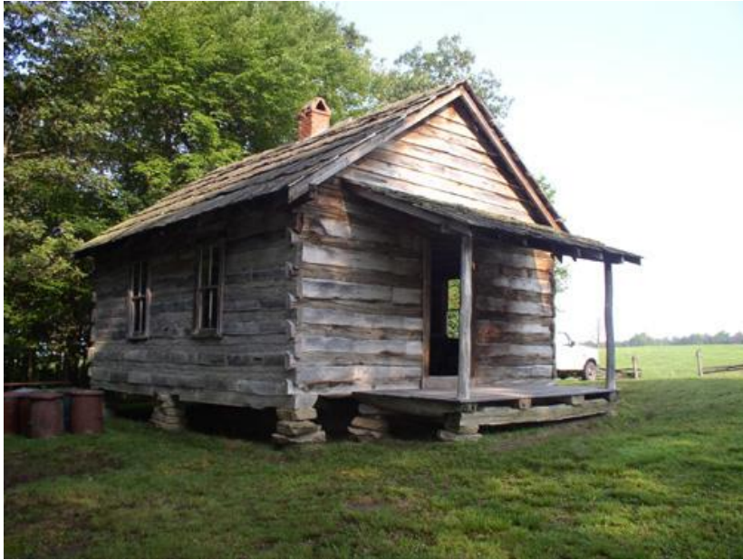
Poor House Cabin